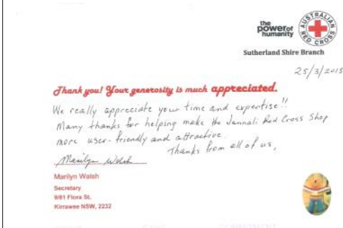
Photo of one of the old tops and a letter of thanks attached.