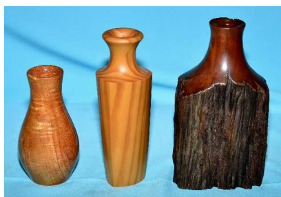
Group of Vases By Bill Black