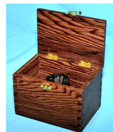
Box by Bill Black