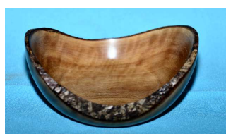
Natural edge bowl Frank Volk