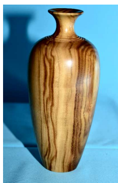
Hollow thin walled vase By Ken Dick