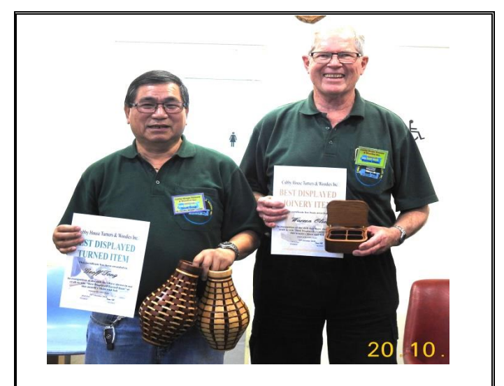
Best Judged on day