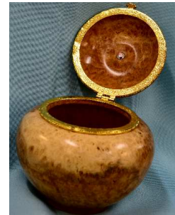
Best displayed turned object Hinged lidded box. Merv Larsson