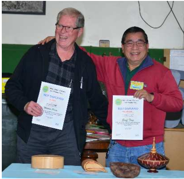
Geoff Tong Segmented lidded box