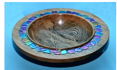
Cheese platter Geoff Tucker