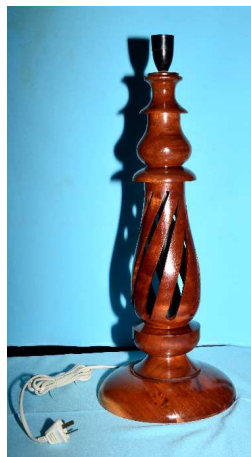
Rosewood table lamp Malcolm Stewart