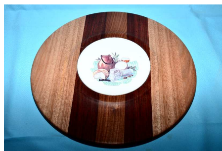
Cheese board Keith Allen