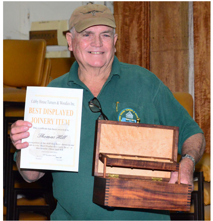
Best Displayed on day

Who is afraid of Alzheimer's - Not me hehe!!