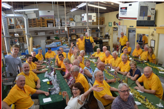
The above photo shows some of the members who attended the sumptuous Christmas lunch provided on Saturday 14 December 2019.

The photo below shows the hard working Catering committee receiving the well deserved accolades for the lovely Christmas lunch.