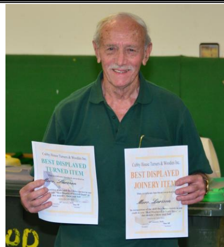
Best Displayed on day