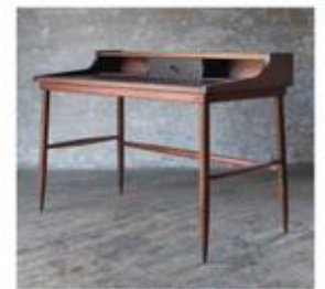
Modern desk with a leather top, p. 34

October 2018 No. 270 Perfect dovetails on the bandsaw • Design secrets from an expert Specialty handplanes • The cabriole leg 3 different ways