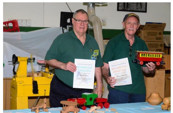
Best Displayed on day