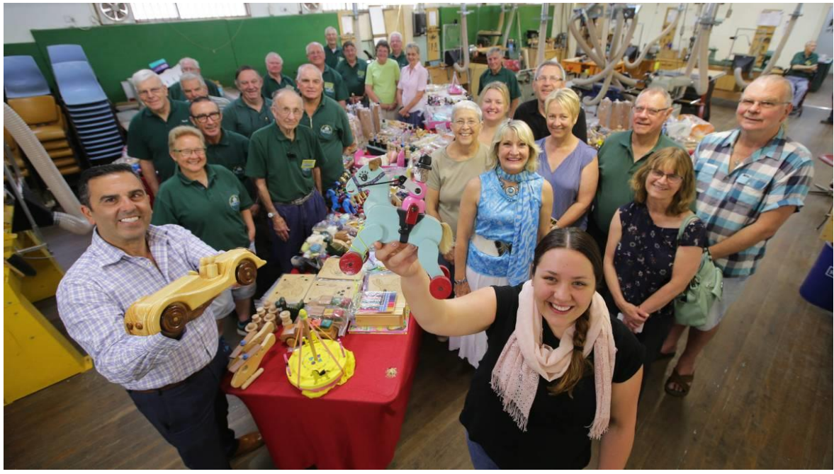
The Cubby House Turns and Woodies with toys they have made during the year which they are donated today to six charities for Christmas to be given to disadvantaged children.