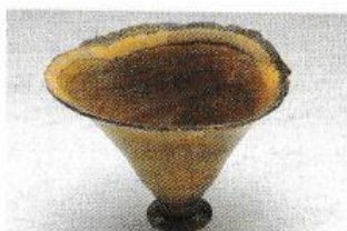
Acacia Robinia Robinia pseudoacacia - UK

In fact the Craft Supplies' stock of turning materials is much more extensive than the timbers featured here and also includes other woodturning materials such as turning nuts, soft stone and polyester products alternative ivory horn an tortoiseshell For further details, contact Craft Supplies Ltd, The Mill Millers Dale, Nr Buxton, Derbyshire SK178SN Tel 01298 871636 F (H298 872263 Email sales@craftsupplies.co.uk Website http://www.craftsupplies.co.uk