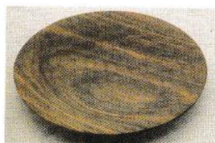
Amazaque/Ovangkol Guibourtia elie - Ivory Coast