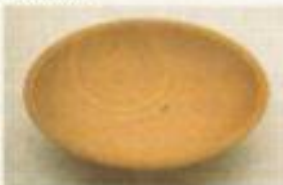
Cherry (American) Prunus serotina - N. America