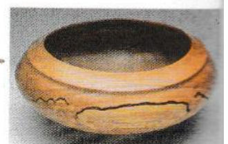
Apple Malus sylvestris