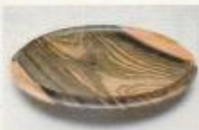
Asian Striped Ebony Diospyros discolor