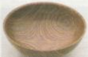
Kingwood (Brazilian) Dalbergia ecastanea - Brazil