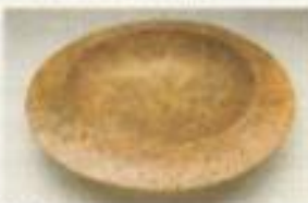
Elm (Burr) Ulmus spp. - UK