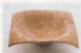
Eucalyptus (Burr) Eucalyptus regnans - Tasmania