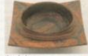
Cocobolo Dalbergia retusa - Mexico