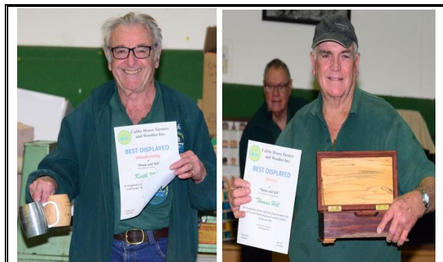
Best Displayed on day