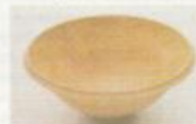
Hornbeam Carpinus betulus - UK