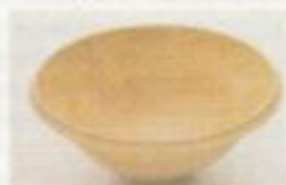
Hornbeam Carpinus betulus - UK