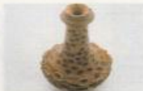
Banksia Nut (or Cuh) Banksia grandis - Western Australia