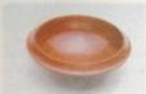
Chas Te Koko Schinus molle - Mexico