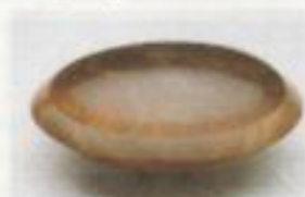
Honduras Walnut Metopium brownei - Mexico