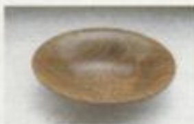
Gutta Percha Euphorbia peruviana