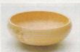
Lime Tilia spp. - UK