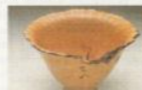
Manzanita Root Arctostaphylos spp - USA