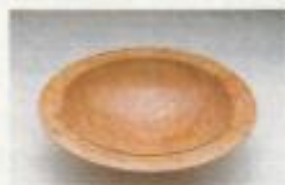
London Plane Platanus hybrida - UK