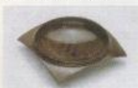
Leadwood Combretum imberbe