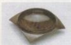
Leadwood Combretum imberbe