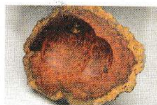
Amboyna burr Pterocarpus indicus - Phillipines