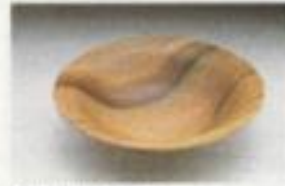
Camphor Laurel Cinnamomum camphora - Australia