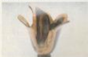
Blackwood (African) Dalbergia melanoxylon - Tanzania