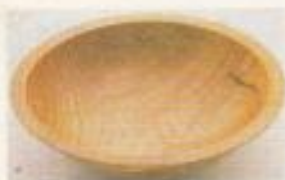
Ash Fraxinus excelsior - UK