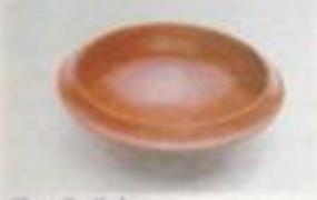
Choe Te Koko Sesuvium portulacastrum - Mexico