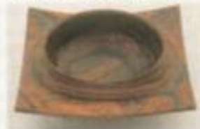
Cocobolo Dalbergia retusa - Mexico