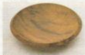
Lignum Phoebe parva - Brazil