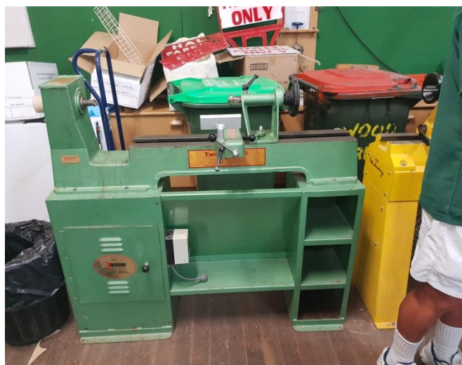
Lathe & Tools $500.00