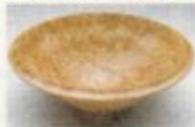
Chestnut (Sweet) Castanea sativa