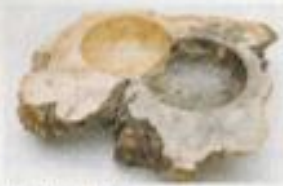
Buckeye Burl Aesculus spp.