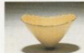
Boxwood Buxus sempervirens - France