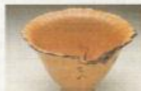
Manzanita Root Arctostaphylos spp. - USA