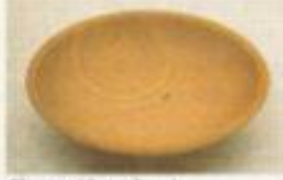
Cherry (American) Prunus serotina - N.America