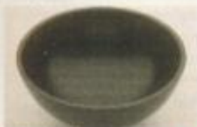
Ebony (African) Diospyros crassiflora - Nigeria