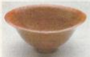
Jarrah (Burr) Eucalyptus marginata - Australia