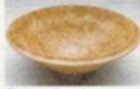
Chestnut (Sweet) Castanea sativa