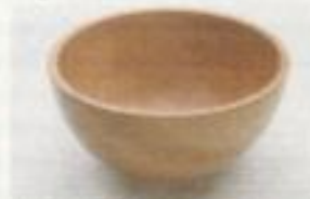
Khaya Mahogany Khaya nyroba