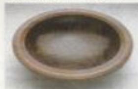
Boree Ascaris sara