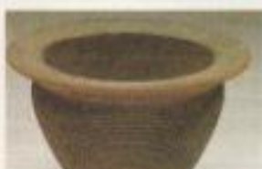
Grass Tree Root Xanthorrhoea preissii - Australia