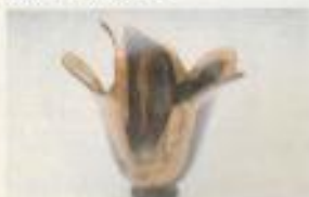
Blackwood (African) Dalbergia melanoxylon - Tanzania