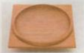
Bubinga Gabonius demarezi - Cameroon