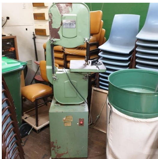
Bandsaw $50.00 Dust extractor $50.00