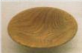
Santa Mexican Rosewood Cordia gerascanthus - Mexico