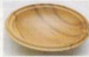
Castalia Boxwood Garry juniperum panicula - Brazil