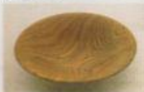
Costa Mexican Rosewood Cordia gerascantha - Mexico