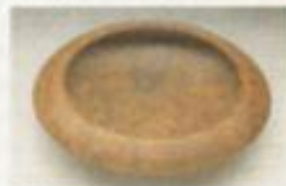
Goldfield Burr Vernonia spp. from Australia Goldfields