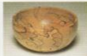
Beech (Spalted) Fagus sylvatica - UK