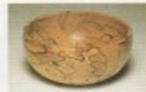
Beech (Spalted) Fagus sylvatica - UK