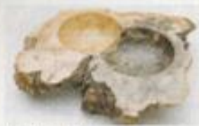
Buckeye Burl Asinus spp