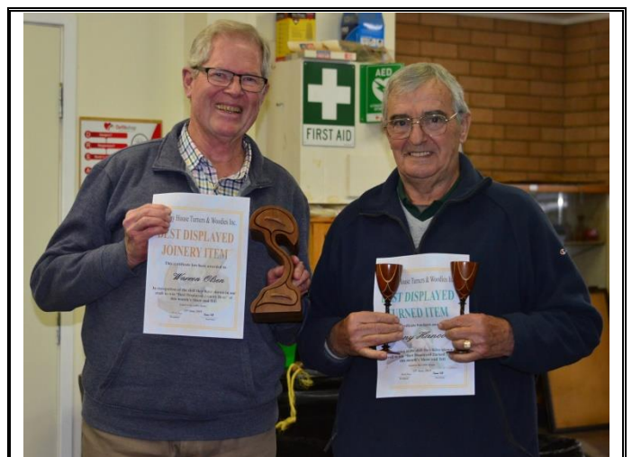
Best Displayed on day