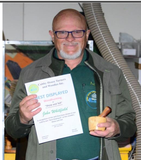
Best Displayed on day