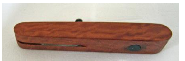
He challenged the member to advise how he bent the nail.