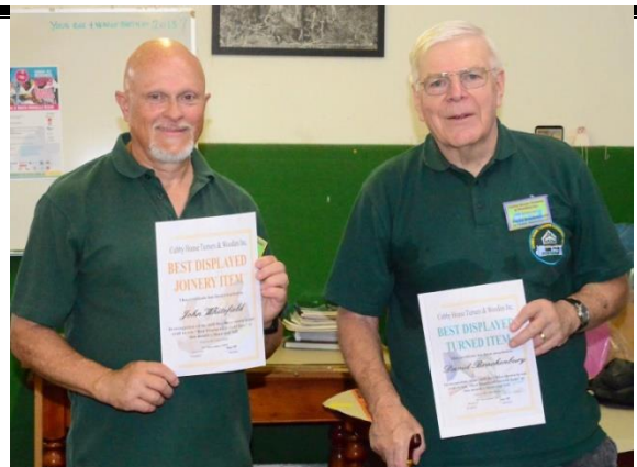
Best Displayed on day