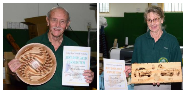
Best Displayed on day