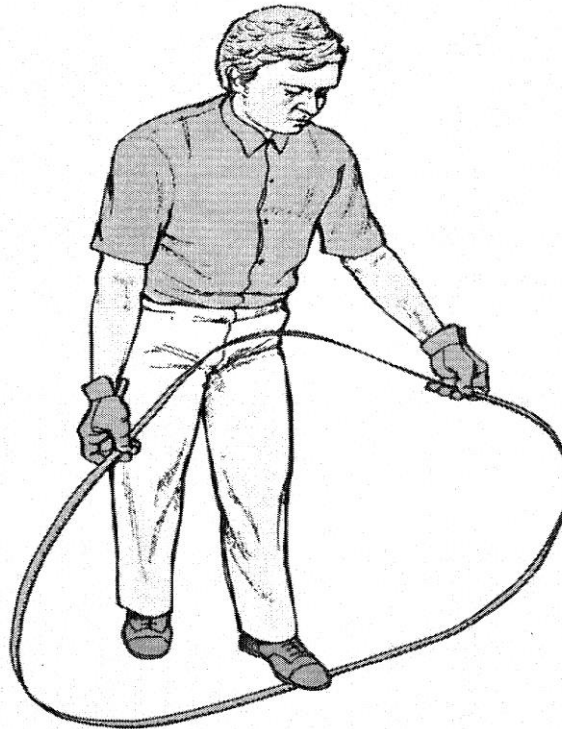
1 Hold the band in both hands and under one foot

To unfold a coiled band, hold it securely while you separate the coils slowly and allow the blade to spring open away from you.