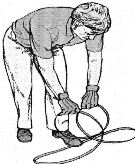
3 Cross the blade over to form three coils, then let it fall